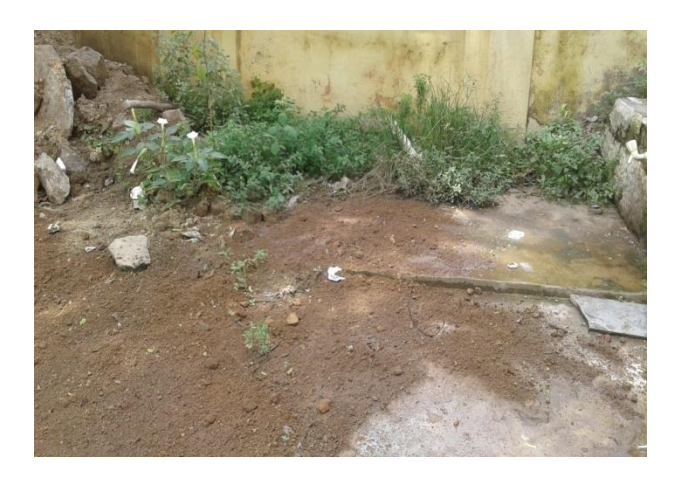
Near the water tank of Ambedkar open university- before and after cleaning.