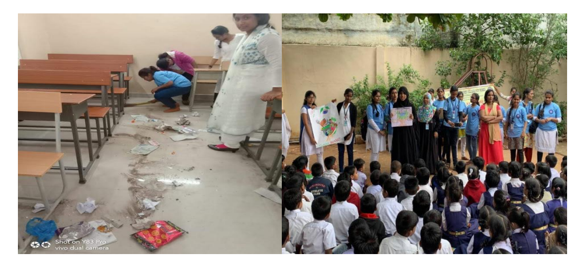
Name of the Activity: Swachh Bharath-Visit to the Government School.

As part of SwachhataPakhwada program NSS volunteers participated in cleaning the classrroms.